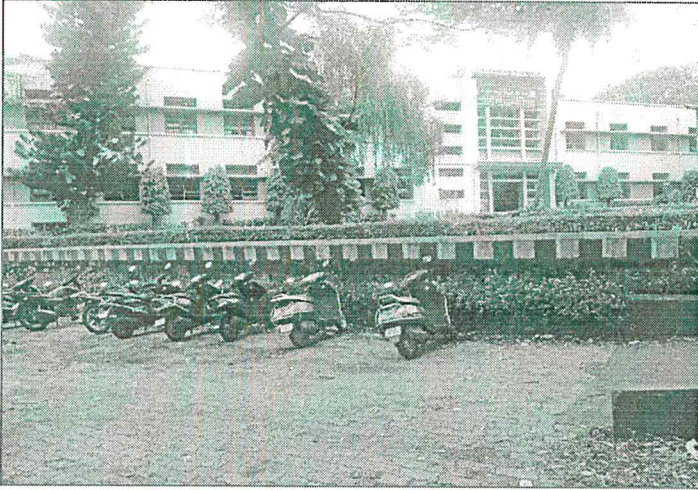
Parking Facility for Students